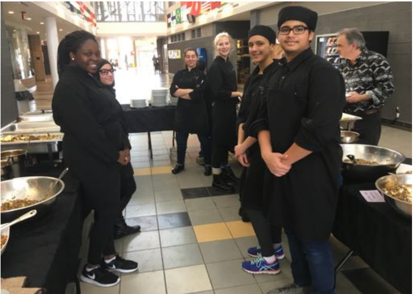
Hospitality students from Longfields Davidson Heights Secondary School